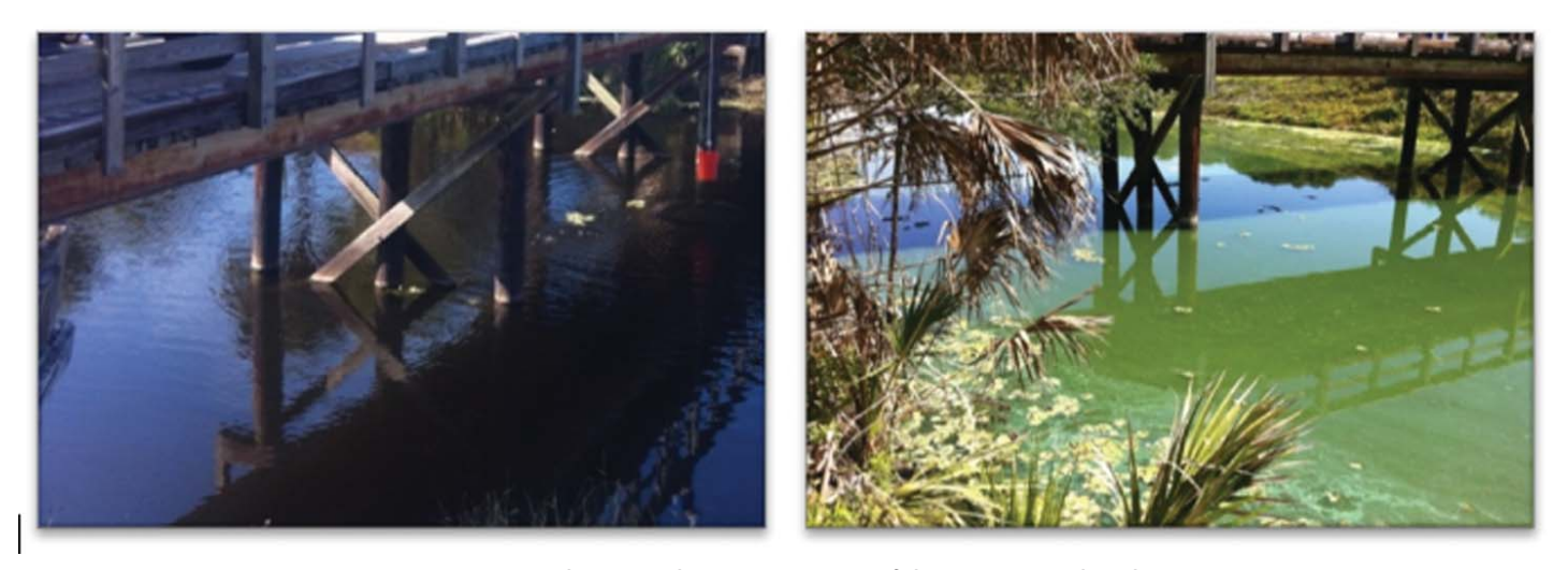
Figure 1. Photographic Comparison of the Cow Pen Slough